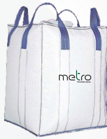
Dust proof bags