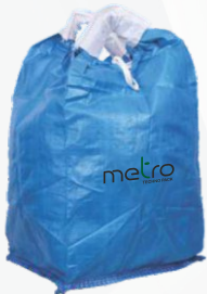
Double loop bags