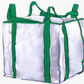
Full loop bags