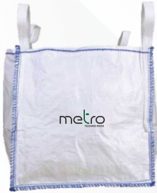
4 panel bags