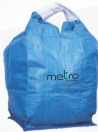
Single loop bags