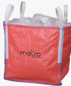
U panel bags