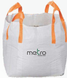
Circular cross bags