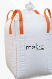
Panel cross bags