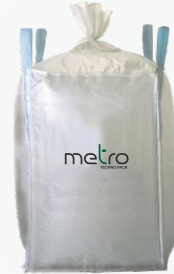
Double layer bags